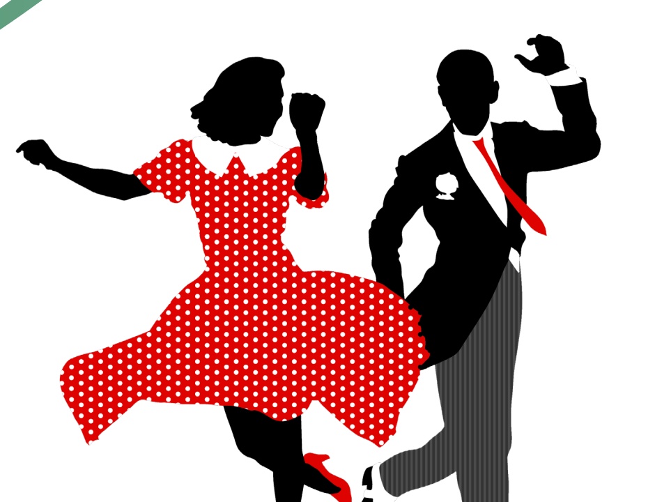
RCM Sparks Explore Big Band Music